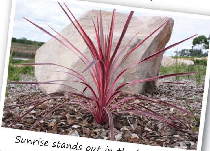
Sunrise stands out in the landscape

It's foliage keeps clean colour even in colder temperatures. As a patio pot plant, Sunrise really shines. It looks great, but best of all, unlike other vivid pinks it keeps looking great. If after many years you are happy for this plant to form a small tree, let it go, but if you want it kept low, cut it back 15cm above ground in autumn or spring and it will re-shoot well. Sunrise performs well when cut back.